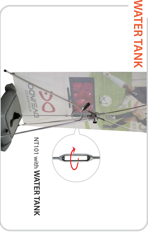
NT101 with WATER TANK